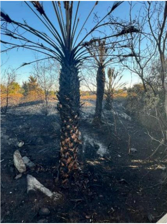
Some charred vegetation from last week's North Beach fire.